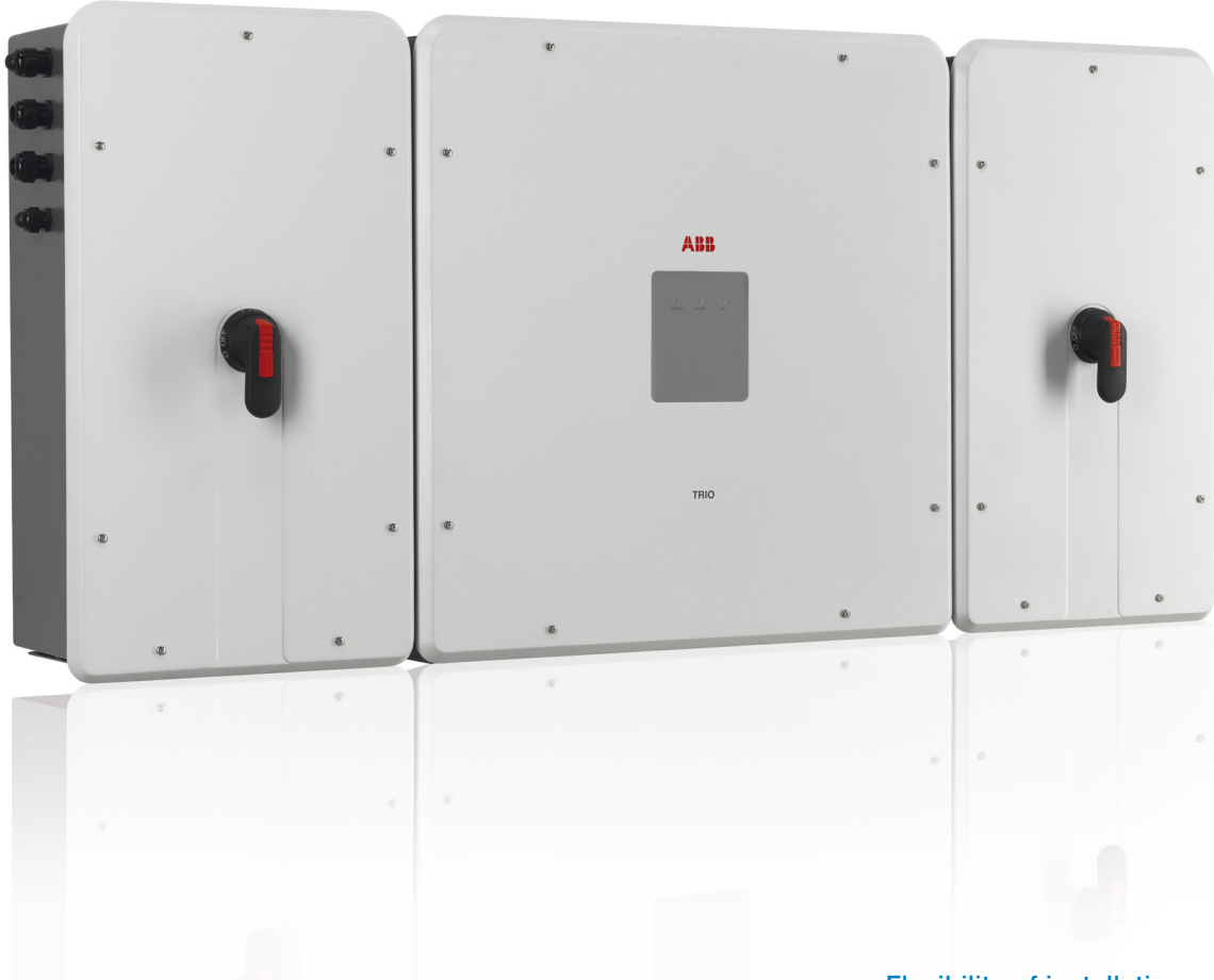
ABB string inverters TRIO-50.0-TL-OUTD 50 kW

The new TRIO-50.0 inverter is ABB's three-phase string solution for cost efficient large decentralized photovoltaic systems for both commercial and utility applications.