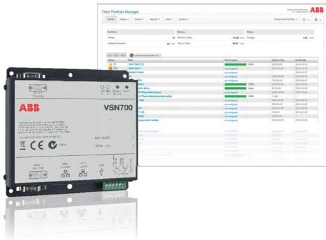
VSN700 Data Logger and web user interface