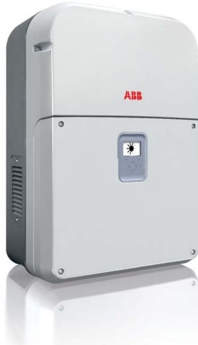
ABB string inverters cost-efficiently convert the direct current (DC) generated by solar modules into high quality three-phase alternating current (AC) that can be fed into the power distribution network (ie grid). Designed to meet the needs of the entire supply chain – from system integrators and installers to end users – these transformerless, three-phase inverters are designed for de-centralized photovoltaic (PV) systems installed in commercial and industrial systems up to megawatt (MW) sizes.